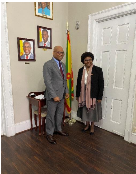
Courtesy Visit from The Ambassador of Malawi, H. E. Justice Esmeralda Fynet Chombo