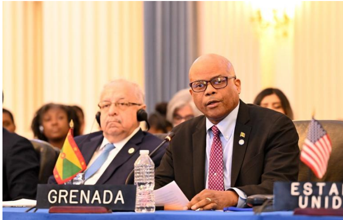
MARCH 10 TH 2025 SPECIAL SESSION OF THE GENERAL ASSEMBLY